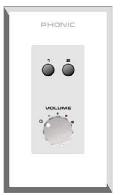
ZP20 is compatible with the Phonic ZX2