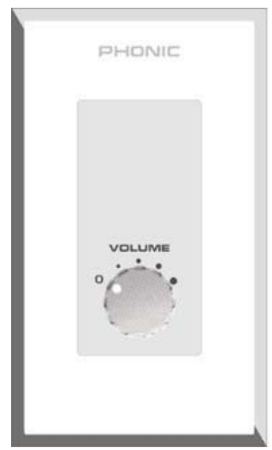
ZP10 is compatible with the Phonic CA35, CA60, CA120, CA240 and ZA100 mixer/amplifiers

4 Zone Remote Paging Control with Level Adjustment