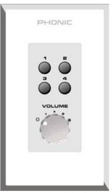
ZP30 is compatible with the Phonic ZX4