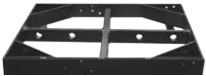
Grid Assembly Flight Frame (W: 760mm / 1000mm)