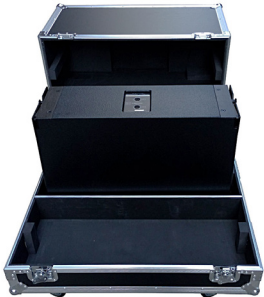
FC8 Flight Case