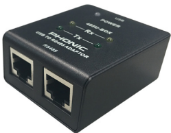
U-BOX RS-485 Adapter