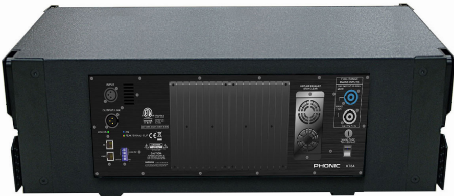
Rear Panel (not to scale)