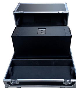
FC8 Flight Case