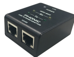
U-BOX RS-485 Adapter