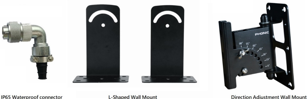
IP65 Waterproof connector

All Air series column speakers come with following three accessories.